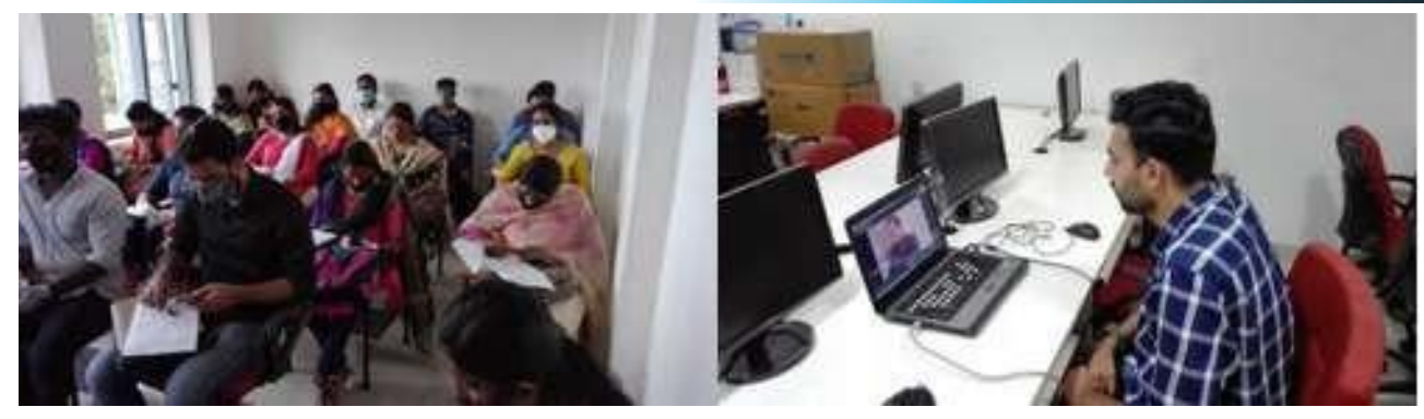
AABASOFT TECHNOLOGIES, Ernakulam CENTRE DRIVE (SKYPE INTERVIEW) - 15/10/2020