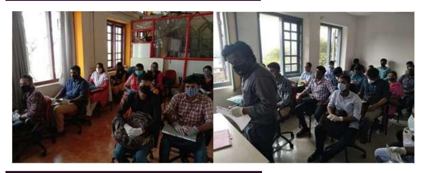
YUVAKERALAM (KUDUMBASHREE) TRAINING CENTRE JOB DRIVE- 31/10/2020