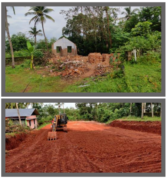
3.c ITI Ettumannur